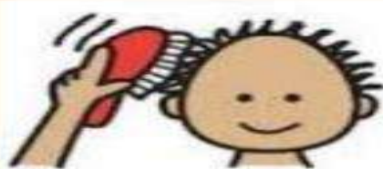
I comb or brush my hair