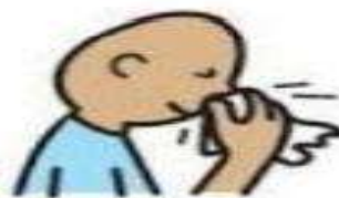
I blow and clean my nose