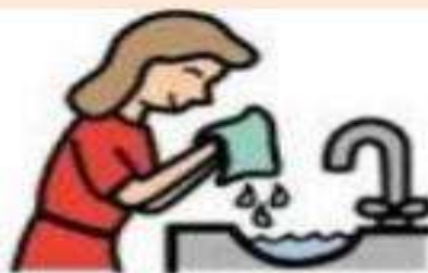
I wash my face and hands