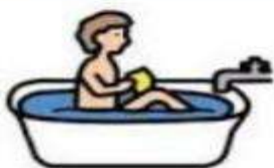
I keep my body clean